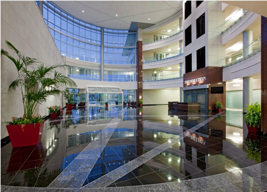
Collin College Office Building - Interiors McKinney, Texas

“We have found PBK to be completely authentic in their expertise. Not only have they provided exceptional service and the necessary expertise needed for our project, their team worked closely with all our internal Intel customers to listen to their needs and provide them with the services necessary to respond to Intel’s performance criteria.” -- CSA Lead / GDC Design Manager, Intel Corporation