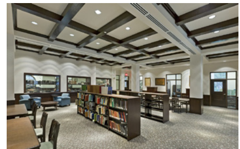
Oliveira Library - Interiors Brownsville, Texas