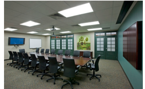
Oil Corporation Headquarters - Interiors Garyville, Louisiana