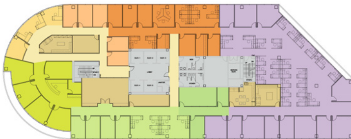
UHY International (Accounting) 93,939 Square Feet Corporate Interior Renovation Houston, Texas

PBK served as lead planner and designer for the complete relocation of this accounting firm to a new, two-level contiguous office space. The interior design focuses on the company's desire to permit maximum flexibility of future office configurations, as well as create an employee-centered work environment completely submerged in natural daylight. With the promotion of an employee-center workplace, the prime corner location of both floors is relegated for multipurpose community centers, equipped with dining facility, kitchen and lounge space with televisions. The design includes nine conference rooms and a multipurpose training room with operable glass wall that expands into the reception lobby to allow for employee office meetings.